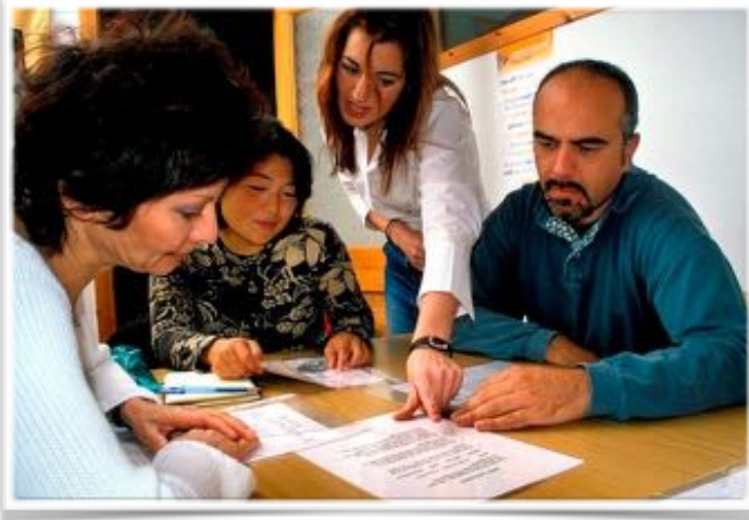
English for business and work