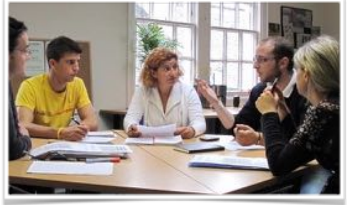
Maximum 5 students per group