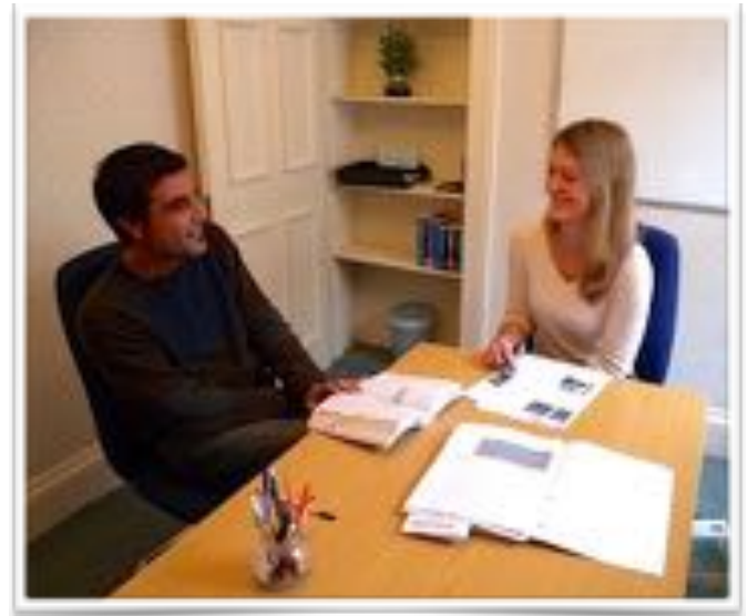
Focus on exactly what you want to learn

During some of your 1-to-1 lessons you can choose to go to a museum, gallery, attraction or walk around the botanical gardens or Old Town.