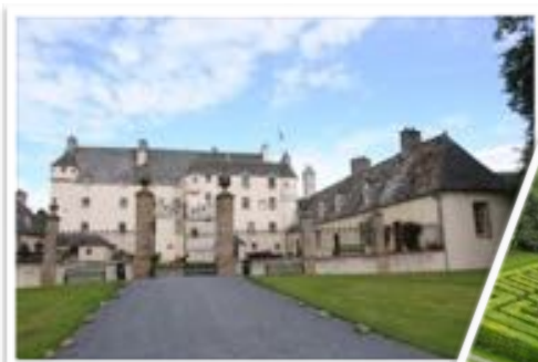
Traquair House and Gardens. The oldest inhabited house in Scotland