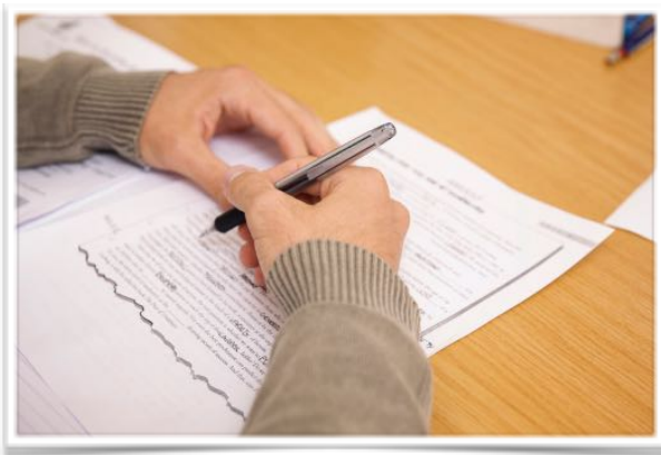
Intensive exam preparation courses available all year

Exam preparation courses are available as Combination Courses and Individual Tuition courses throughout the year.