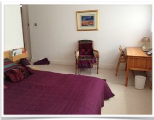
Example bedroom in homestay

Homestay accommodation is provided in comfortable and conveniently located homes all over Edinburgh .