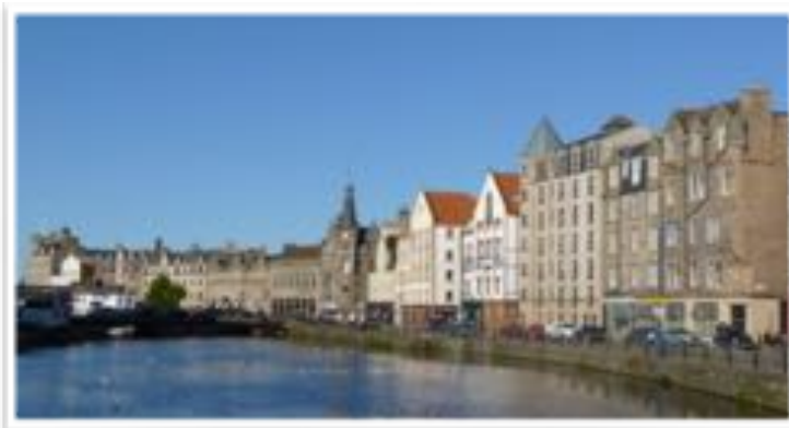
Learn English in the morning and visit Edinburgh in the afternoon

The afternoons are free for you to explore the city on your own or take part in optional activities arranged by ECS Scotland. Whisky tasting, a Scottish cookery course, a historical and scenic walk, visit the Royal Yacht Britannia, Edinburgh Castle or go shopping.