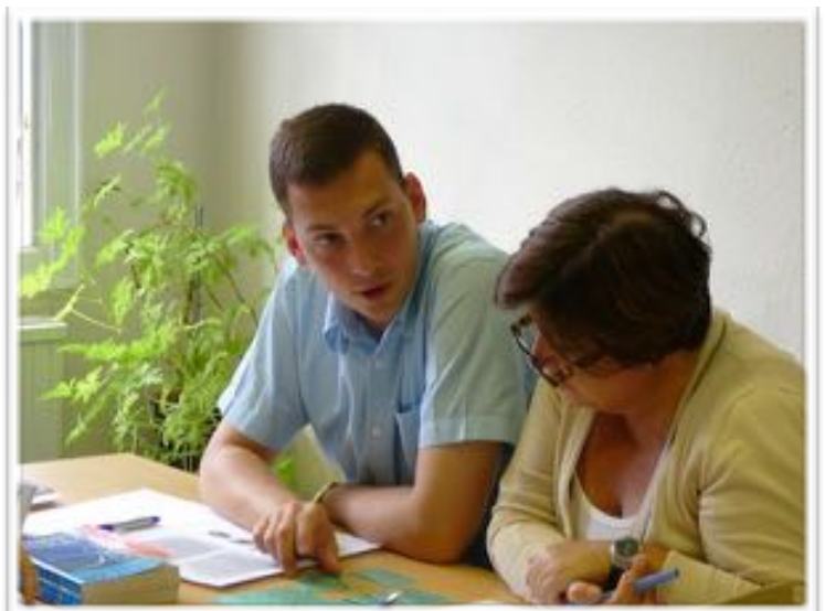
Choose an intensive Combination Course, Start any Monday