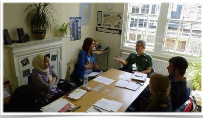
Improve your speaking skills in a small group

General English courses have a guaranteed maximum of 5 students per group.