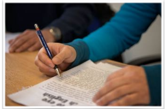
Improve your Academic English before starting university

Intensive Academic English courses are available throughout the year as a Combination Course for students who require assistance with proof-reading their written work, or help preparing a presentation or project in English.