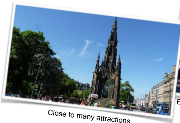
Close to many attractions

ECS Scotland is located in the centre of Edinburgh. The school is easily accessible from all parts of the city by bus and is within easy walking distance of many of the main attractions, parks, restaurants, cafes and shops.