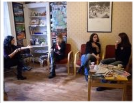
Practice English conversation

Practice English conversation in a relaxed setting.