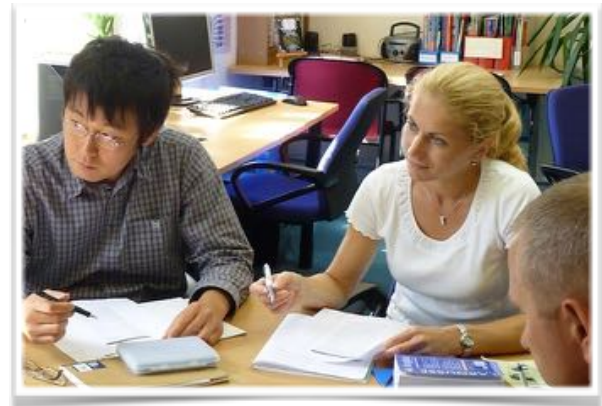
English for adult professionals from all over the world

ECS Scotland designs courses for professionals working in all areas of business .