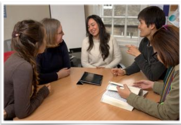
Courses available to start any Monday

General English group courses are available for all levels from beginner to advanced