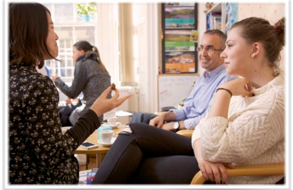
Communicate effectively outside the classroom

You will carry out discussion, problem-solving and presentations in small groups as well as learn about issues such as cross-cultural theory , stereotypes and how it effects our communication. See website for course