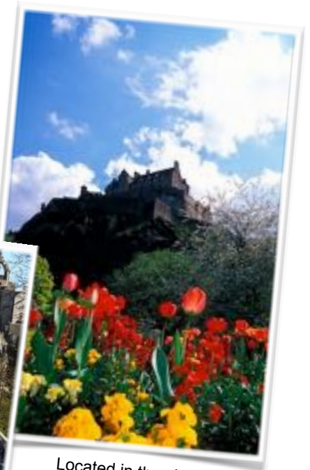
Located in the city centre