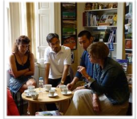
Free tea and coffee at break time