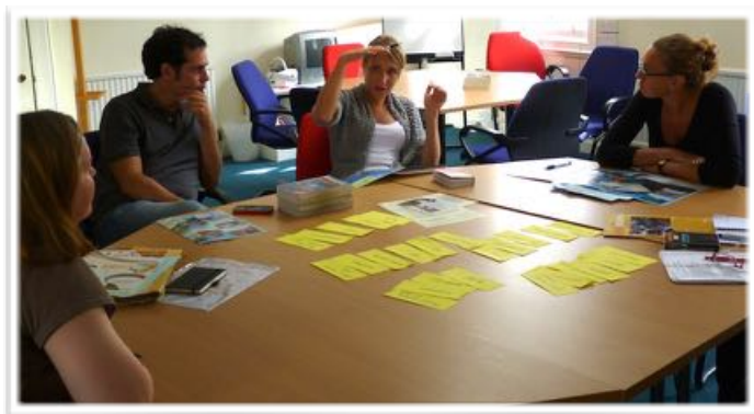
Refresh your English and enjoy a weekend in Edinburgh

Our Weekend Refresher Course gives you the opportunity to refresh your spoken English language skills whilst enjoying a weekend or long-weekend holiday in Edinburgh .