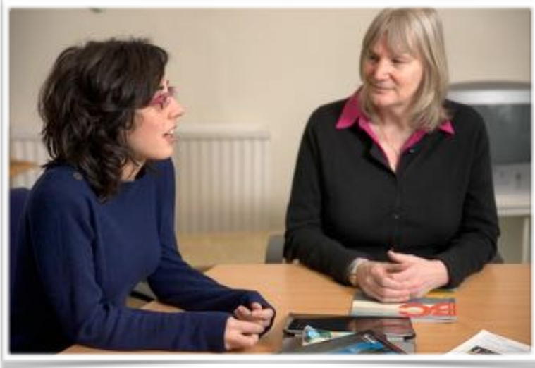
Work 100% at your own speed

If you wish to leave the classroom and practise your English by visiting some of the sights in Edinburgh, you can take your 1-to-1 teacher with you during your class time.