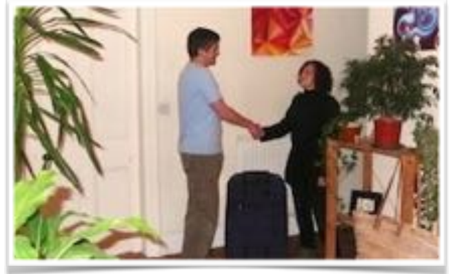
A friendly Scottish welcome

ECS Scotland arranges homestay accommodation for students studying at the school. Staying with a native speaker host enables you to spend as much time as possible speaking English outside the classroom . Living with a local person also gives you an insight into British and Scottish culture .