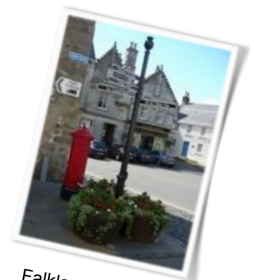
Falkland Palace and village