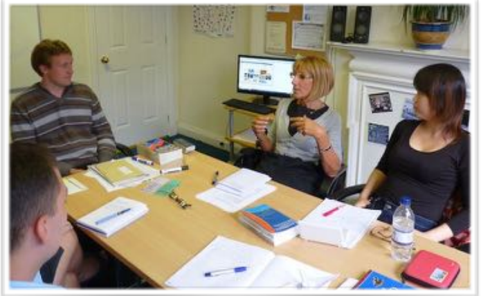
Small group General English in the mornings

The aim of these courses is to develop overall English communication skills alongside more specific English language areas such as; business, medicine, law, environmental science, politics, aviation, tourism, journalism, sales, marketing, politics . Other specific needs or topic areas can be covered on request.