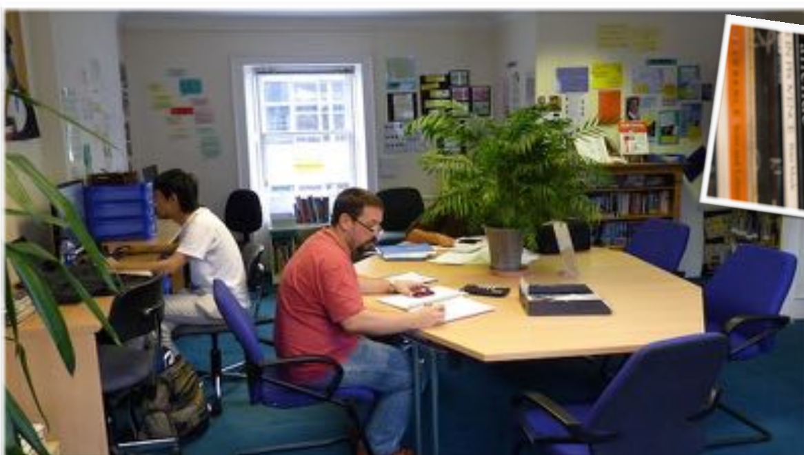
Self-study area. Take advantage of extra listening, reading and grammar material.

We encourage all students to use the resources available to consolidate what is learnt in the classroom .