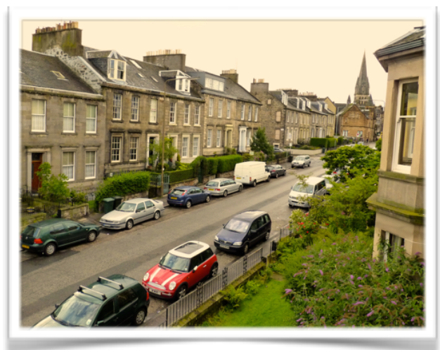
Example location of homestay accommodation

We advise early booking for July & August