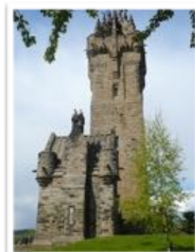
The William Wallace monument