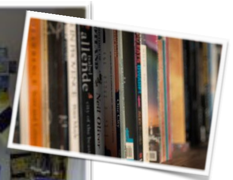
Borrow books and DVDs