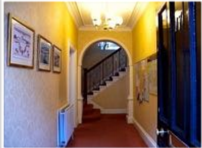
Welcome to ECS Scotland

ECS Scotland is a family-run, British Council accredited English language school founded in Edinburgh in 1995.