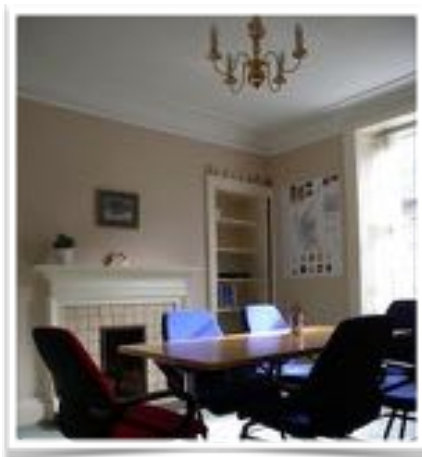
Georgian house with classic features

Teaching takes place in an attractive Georgian house, which maintains many of the classic features of a building from that era. The building has been refurbished to provide a comfortable and calm learning environment.