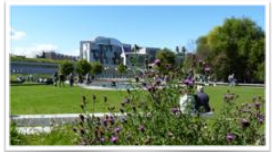
The Scottish Parliament