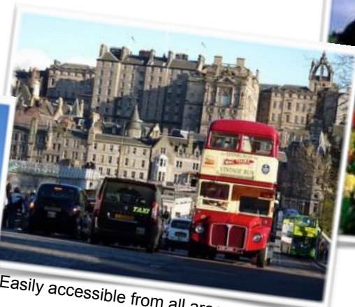
Easily accessible from all areas of the city