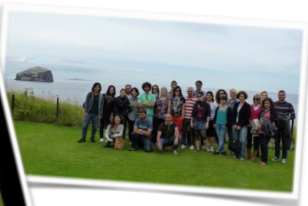
Tantallon Castle with views of the Bass Rock