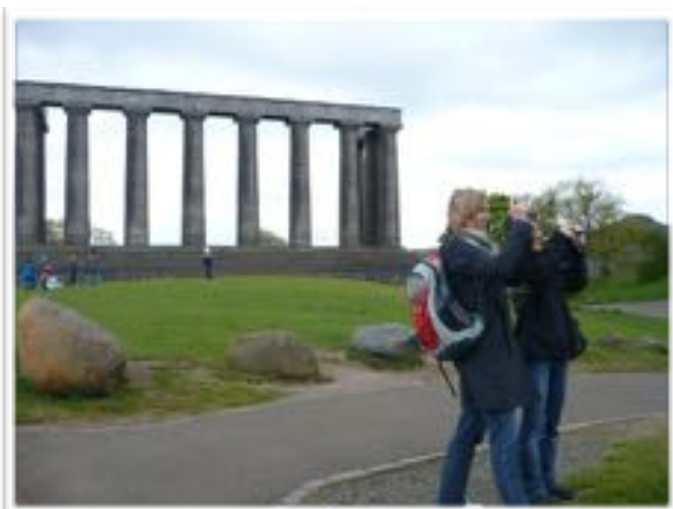
Practise your English while visiting Edinburgh with your teacher

Individual Tuition courses focus 100% on your specific needs and requests.