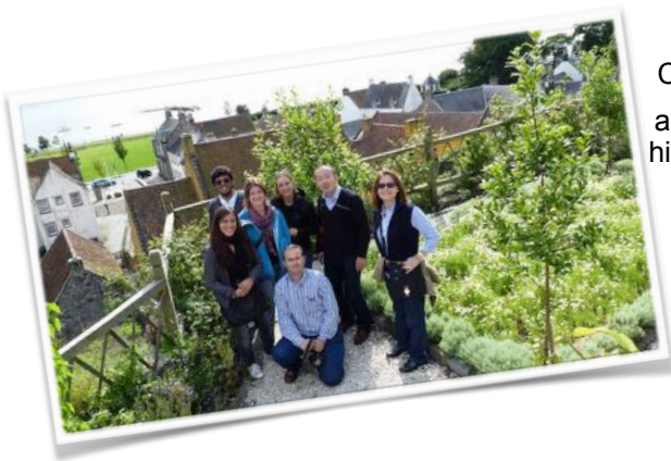
Culross Village, a well preserved historic village by the sea

Glenkinchie Whisky Distillery, Falkland Palace and village, John Muir's birthplace and Dunbar, Culross Village, Stirling Castle, New Lanark, Tantallon Castle, Hopetoun House, Britannia, Museum of Flight, Traquair House & Gardens, Holyrood Palace.