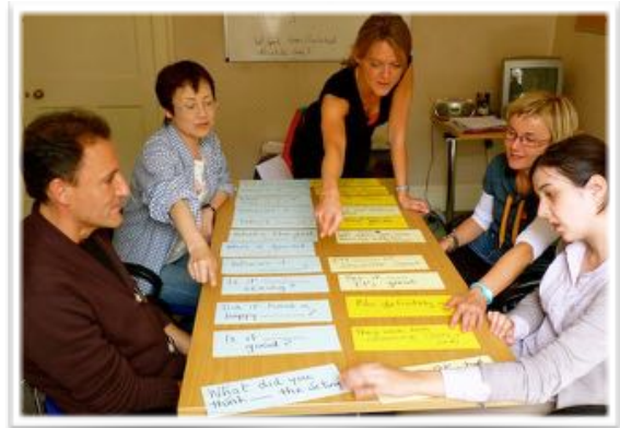
Use English for traveling, socialising and working

Gain confidence to use English for traveling, socialising, and working, or for reading, watching and listening to authentic material in English with ease.