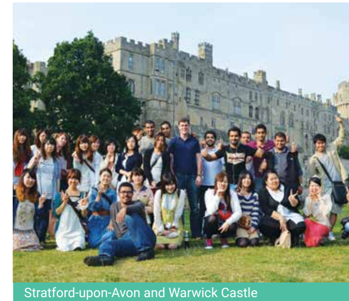
Stratford-upon-Avon and Warwick Castle